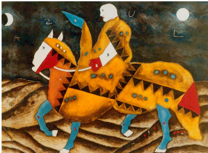
Caballito, Javier Arevalo