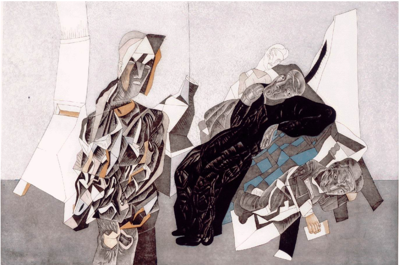
Teorema, Jose Luis Cuevas