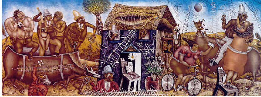
Silla Vigilante, Maximino Javier